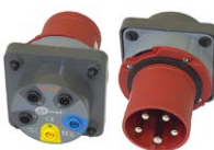
Three-phase socket adapter 63 A