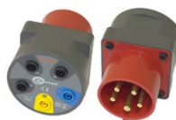
Three-phase socket adapter 16 A / 32 A