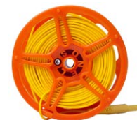
Test lead for earth resistance mea- surement 50 m