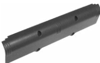
Battery pack 4xLR14