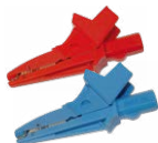
Crocodile clip 1 kV 20 A red /blue