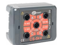
CS-5kV cali- bration box