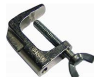
Cramp with banana socket