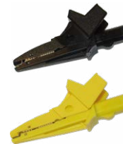
Crocodile clip 1 kV 20 A black / yellow